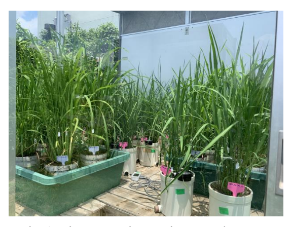
Fig.1 Rice experiment in greenhouse.

Experimental design : Two rice genotypes namely Takanari (lowland-adapted indica) and IRAT109 (upland-adapted japonica) were planted to Wagner pots (4.0L) ( Fig.1 ) in the summer of 2019 in flooded (3-5 cm water depth) and aerobic water regime in a greenhouse with relative humidity of 52-75% and air temperature of 29/22°C (day/night). Porous-cup tensiometers were installed at 10 cm depth in aerobic water regime pots to facilitate irrigation when soil moisture tensions (SMT) were below -30kPa.